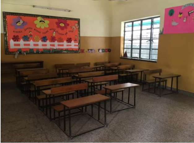
Arya Shishu Shala Primary School, New Delhi , India