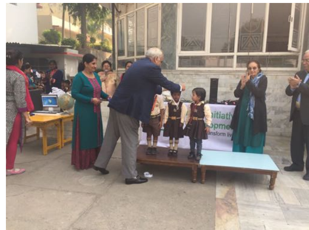
Our investment in the future generations

Banyan Initiative for Development also called Bi4D.org is a volunteer, non-profit and non-governmental organisation (NGO) based in Geneva, Switzerland dedicated to empowering children through education. Bi4D.org aims to work towards improvement of ongoing programs both in qualitative and quantitative terms in selected schools located in India (New Delhi and Goa).