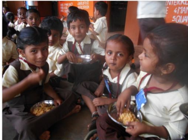
Trust of Nano Nagle School, Goa, India